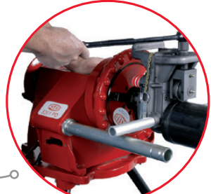
RGCOMBO2 with 5301PDCOMP (sold separately)