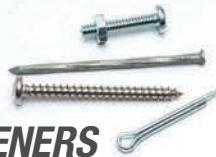
FASTENERS Bolts, nails, rivets, and screws