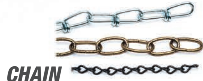
CHAIN Light duty, hobby, and craft chain