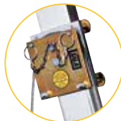
8003238 | Leg Mount Pulley Bracket for Tripod Leg