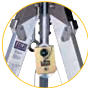
8003205 | Snatch Block Pulley Assembly for use with Tripod Eye Bolt