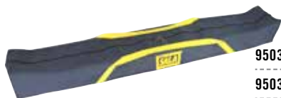
9503094 | Tripod Carry Bag for 8000000 Tripod